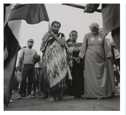
© Ans Westra, courtesy of Suite Gallery

The proposal outlined above is one possible approach. There remains a need for a great deal of research, analysis, discussion and reflection before all the alternative solutions are identified and explored. However, it is my sincere hope that through the constitutional review, we will be able to construct a House of Representatives fit for the future, one that can deliver New Zealanders a more secure platform upon which to build a creative and dynamic nation that enables us all to walk boldly into the future together.