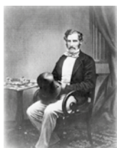
Figure 4: The trinity of promoters of New Zealand history

There is further evidence that New Zealand is no longer new on the shelves of our country's many libraries. Three gentlemen – Sir George Grey, Thomas Hocken and Alexander Turnbull, known as the pre-eminent New Zealand trinity of effective promoters of New Zealand history 9 (see Figure 4) – worked hard to make our past accessible to future generations. All three donated collections to the people of this country, with Turnbull specifically gifting his collection 'as the nucleus of a New Zealand National Collection'. 10 Turnbull insisted on keeping his collection in one place, emphasising that the value of a collection goes beyond that of the individual books, and that the essence of a nation might be captured within the pages of such a collection.