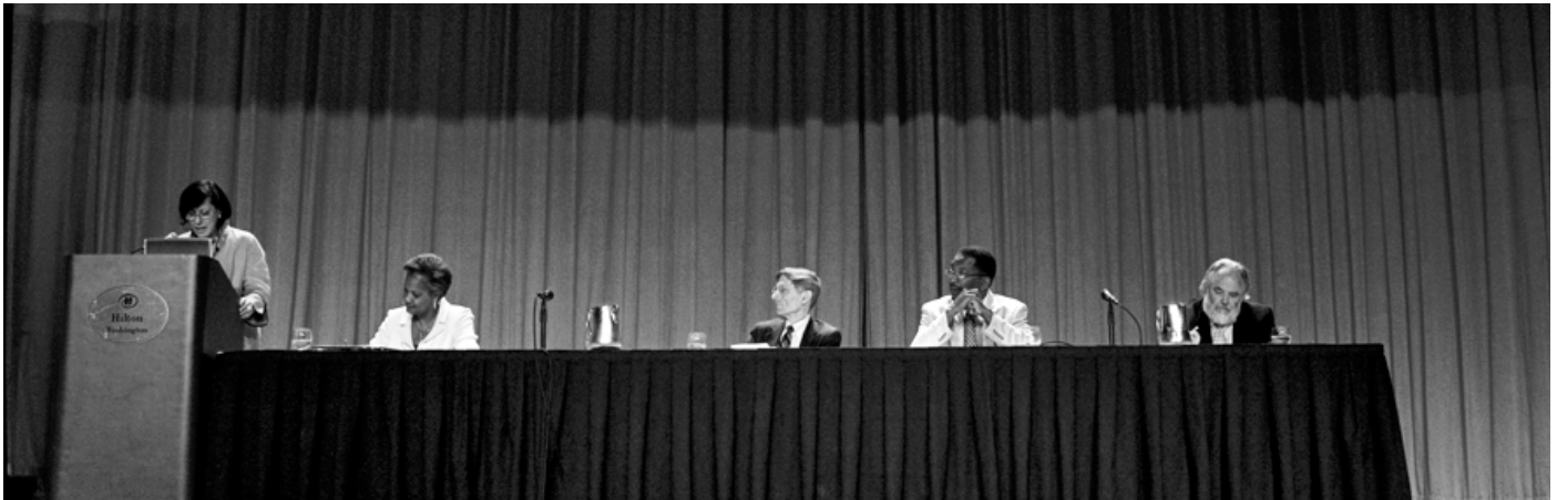
World Future Conference 2008, Washington D.C.