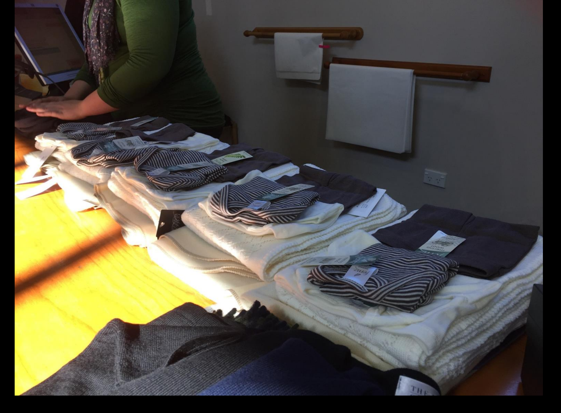
The Wool Company from Utiku, Taihape donated clothing for the baby boxes.