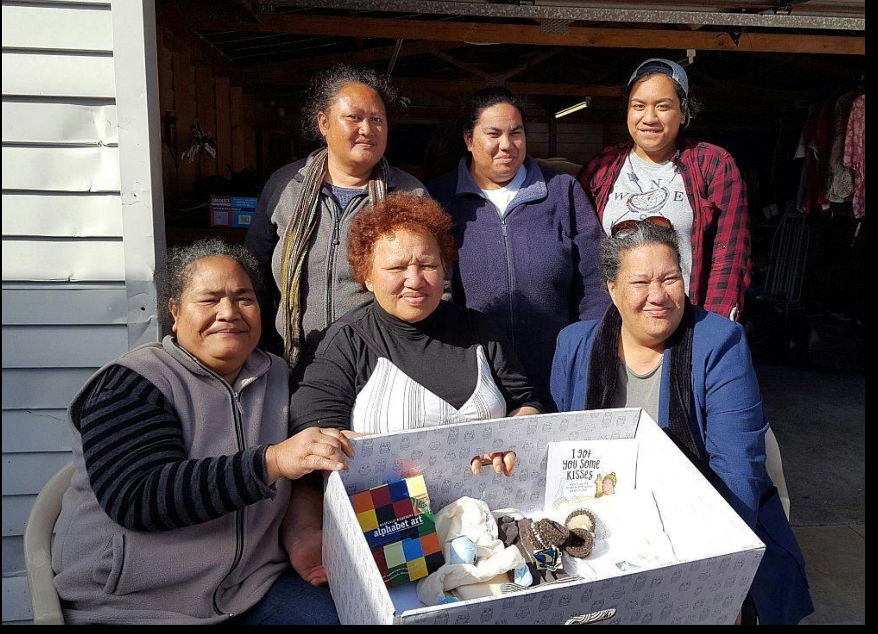
Members from the Fordlands Community Centre in Rotorua with a baby box ready to go off to a new mum.