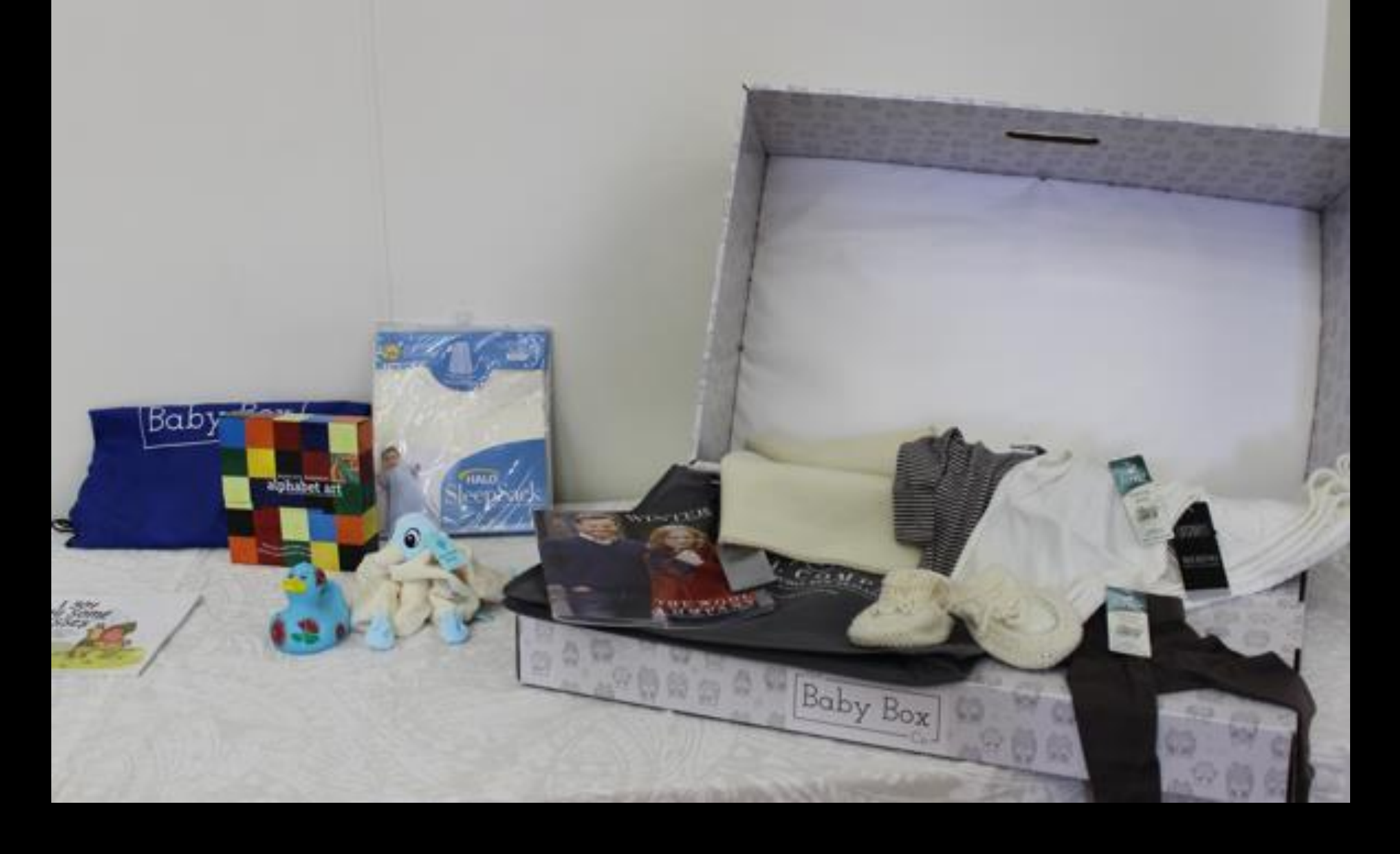
A baby box at the TacklingPovertyNZ Kaikohe workshop.