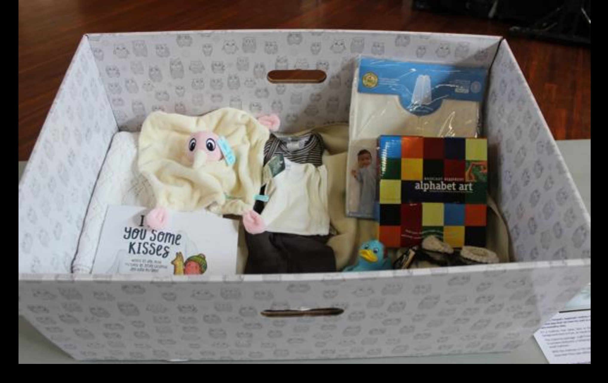
A baby box at the TacklingPovertyNZ Kaitaia workshop.