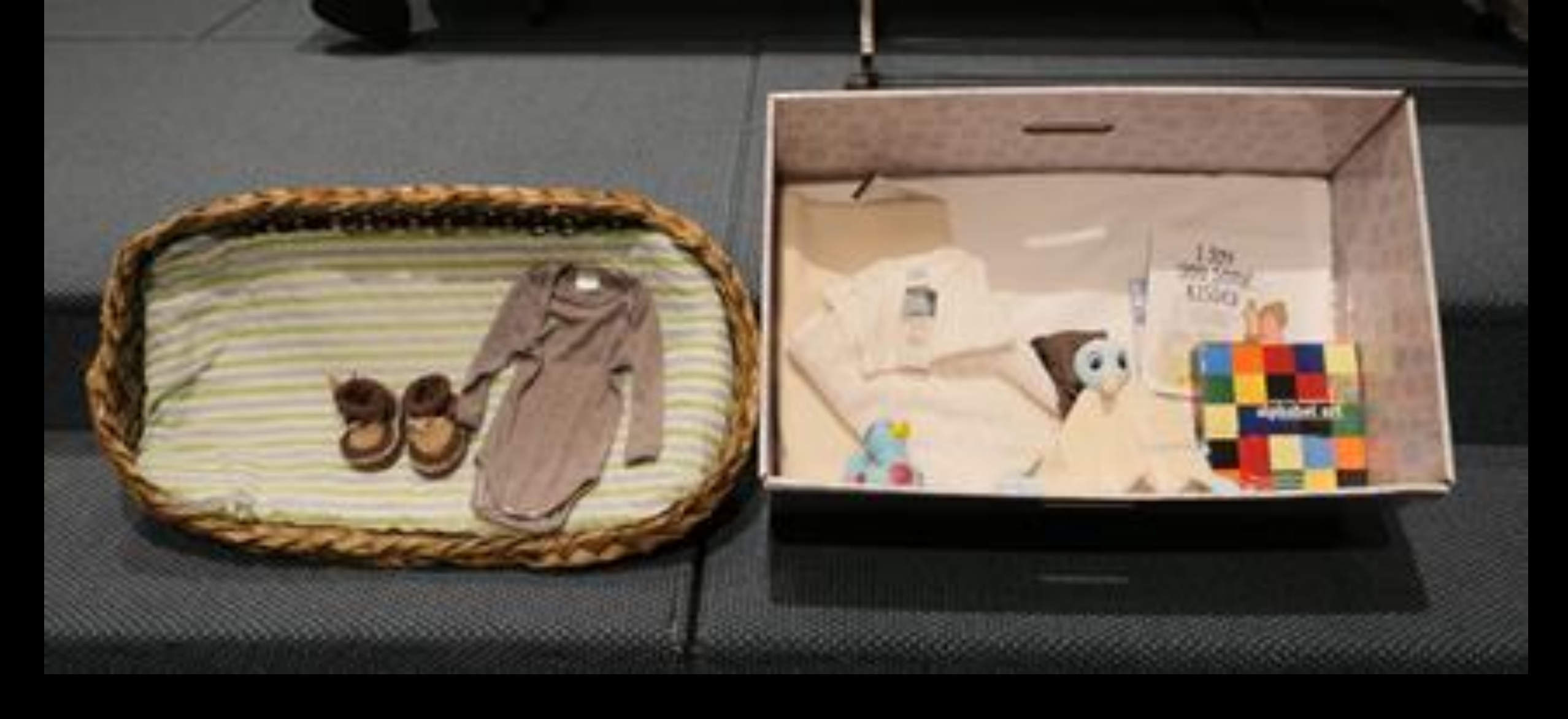
Pepi pod and baby box side by side.