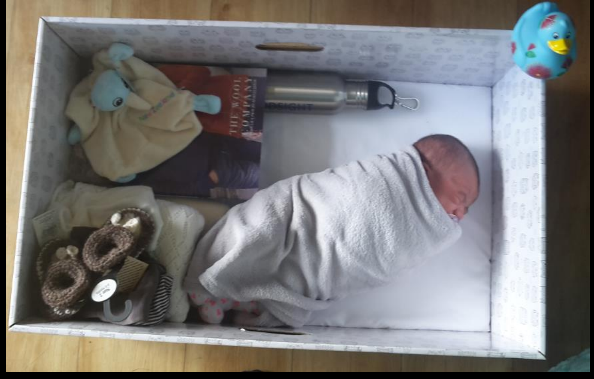
A newborn from Gisborne sleeps in a baby box gifted by the Gisborne District Council.