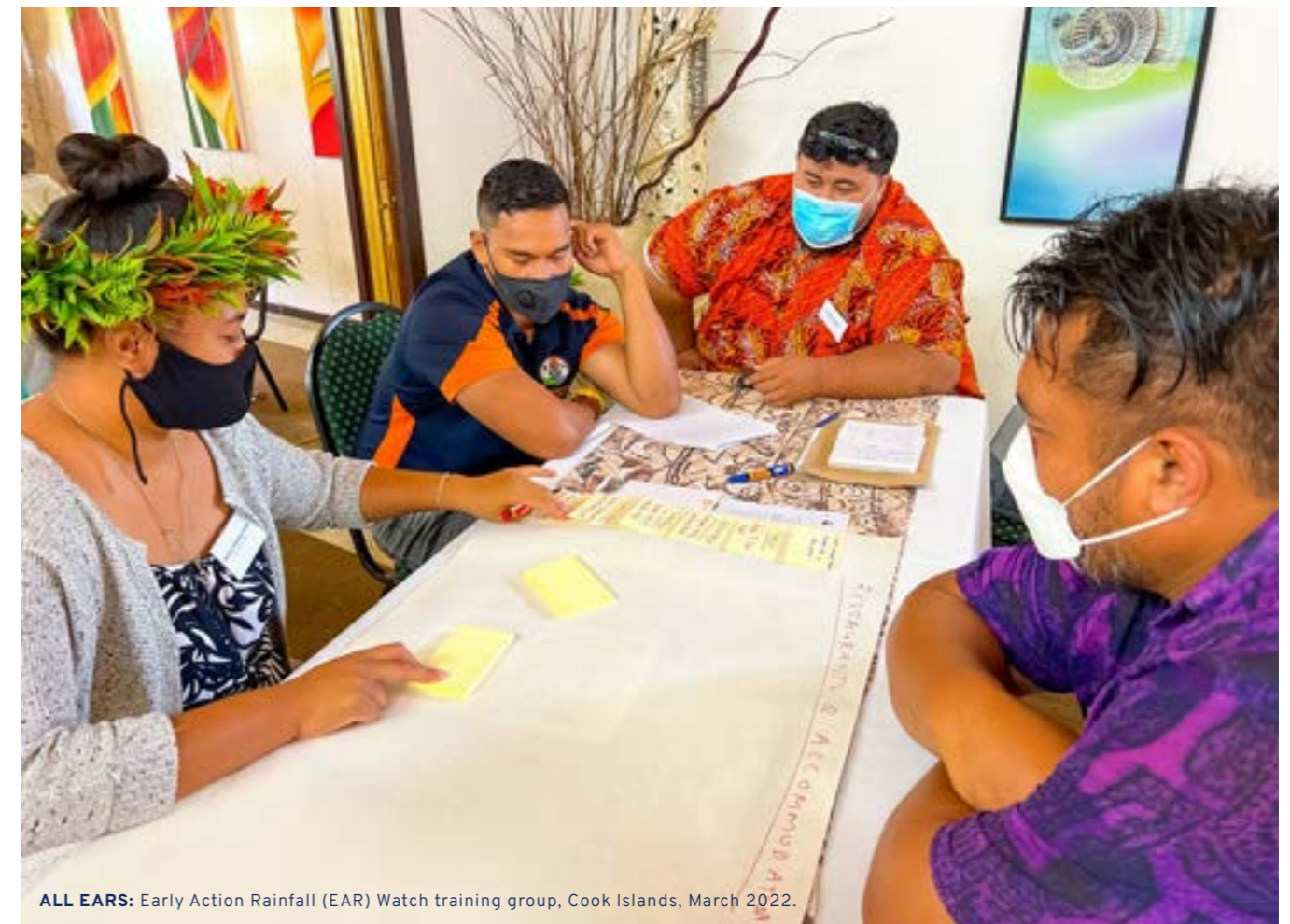
ALL EARS: Early Action Rainfall (EAR) Watch training group, Cook Islands, March 2022.

This approach reinforces our aim of promoting a partner-led, community-enabled model of responding to the challenges of climate change.