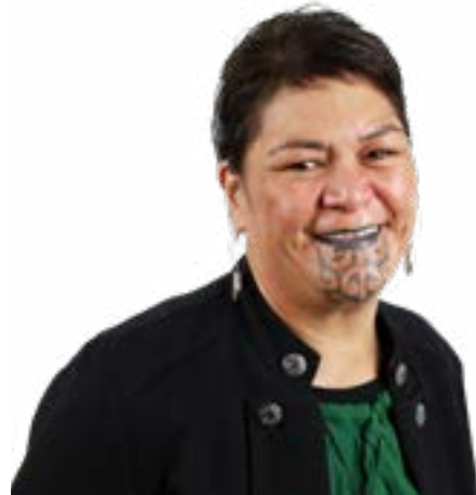
HON. NANAIA MAHUTA Minister of Foreign Affairs