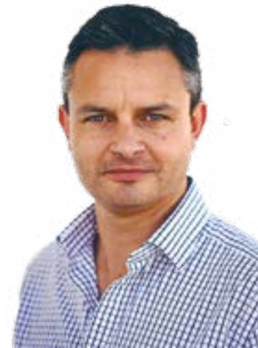
HON. JAMES SHAW Minister for Climate Change