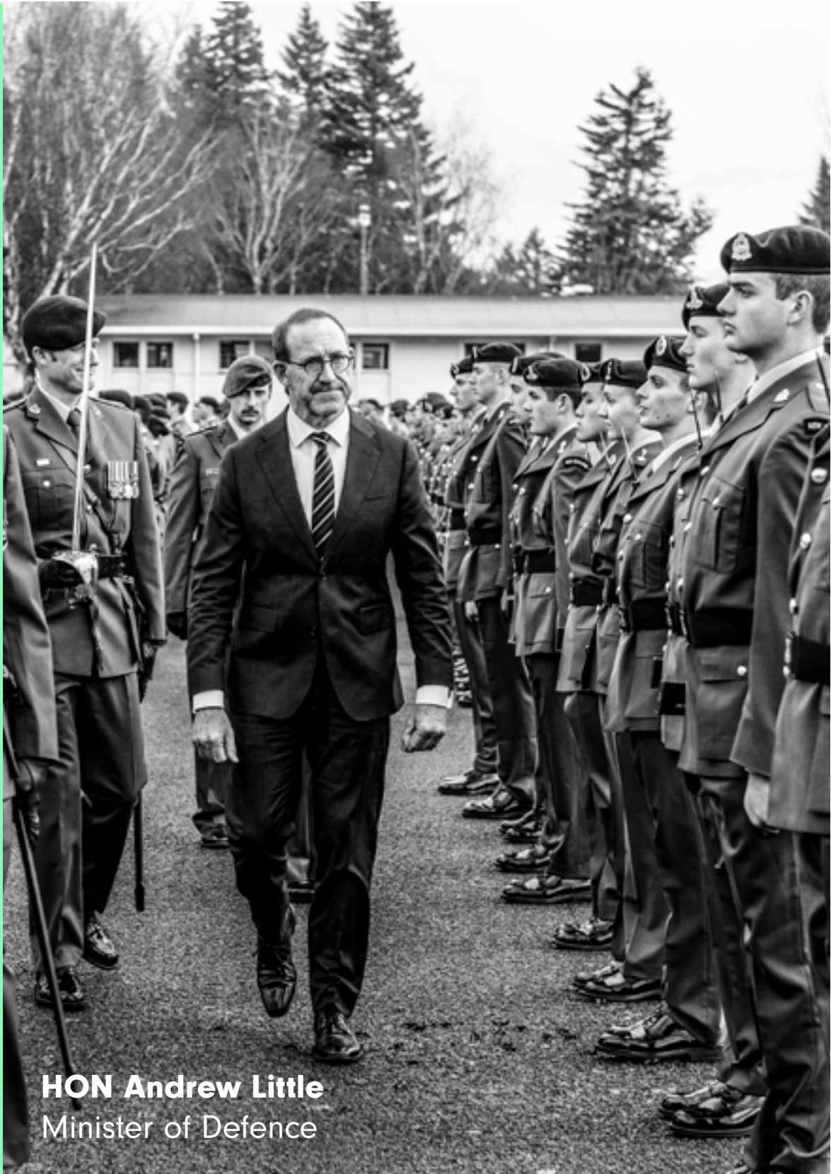
HON Andrew Little Minister of Defence