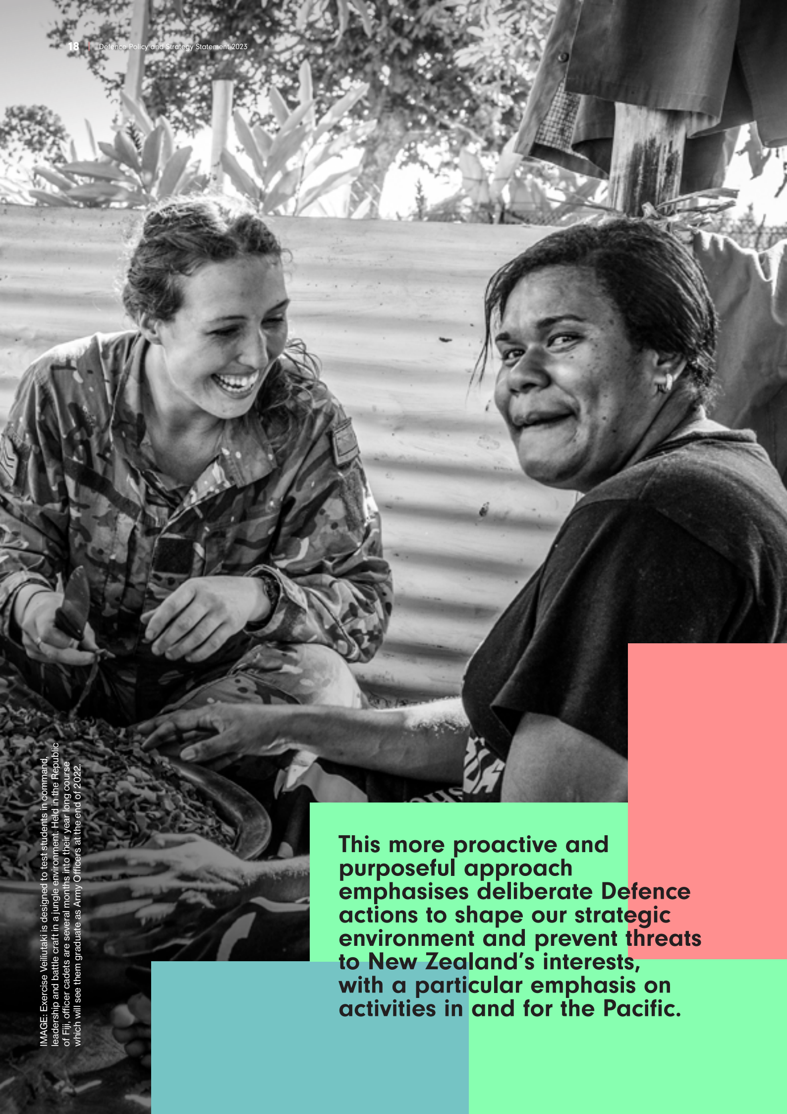
IMAGE: Exercise Veijitaki is designed to test students in command, leadership and battle craft in a jungle environment. Held in the Republic of Fiji, officer cadets are several months into their year long course which will see them graduate as Army Officers at the end of 2022.

This more proactive and purposeful approach emphasises deliberate Defence actions to shape our strategic environment and prevent threats to New Zealand's interests, with a particular emphasis on activities in and for the Pacific.