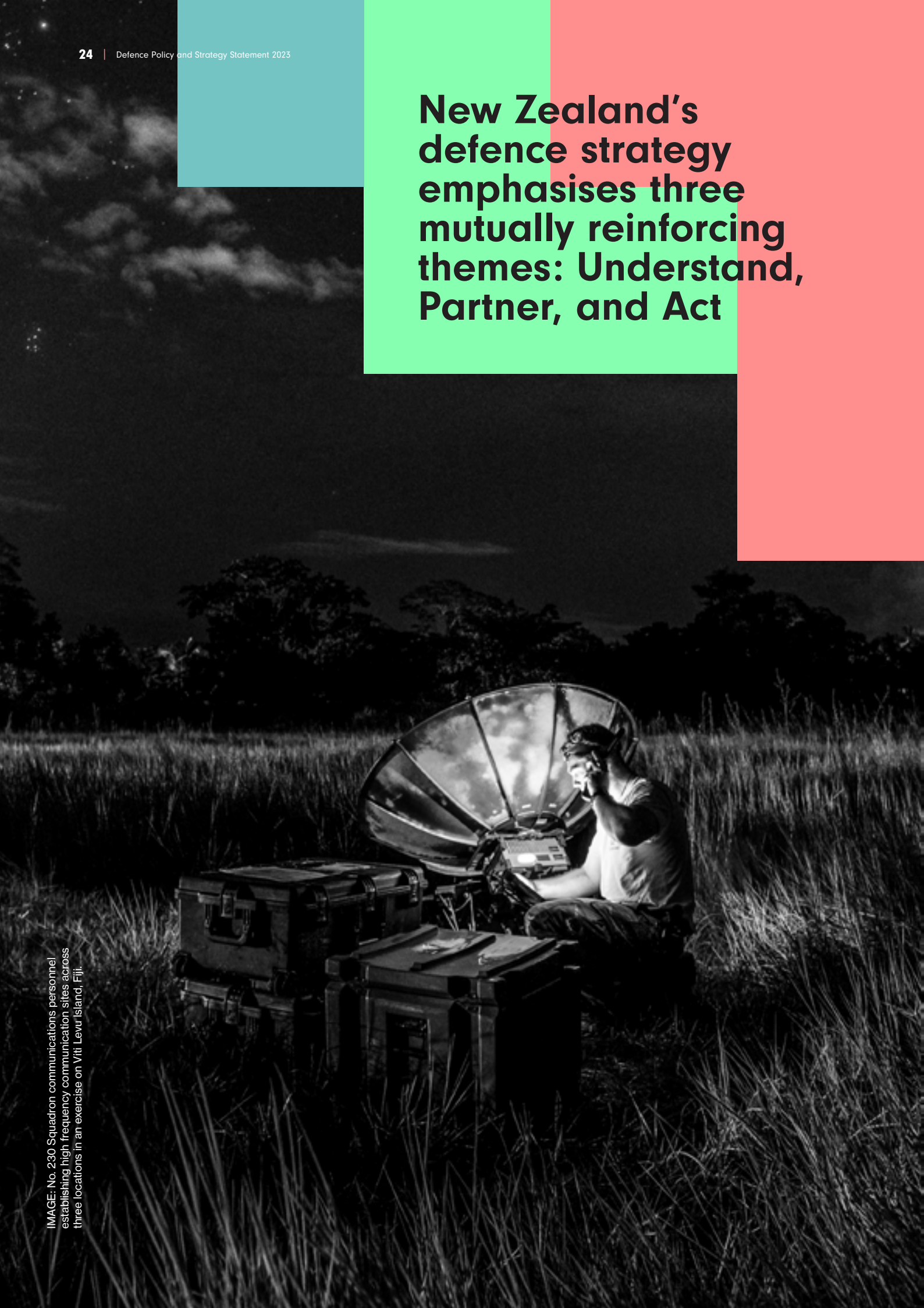
IMAGE: No. 230 Squadron communications personnel establishing high frequency communication sites across three locations in an exercise on Viti Levu Island, Fiji.