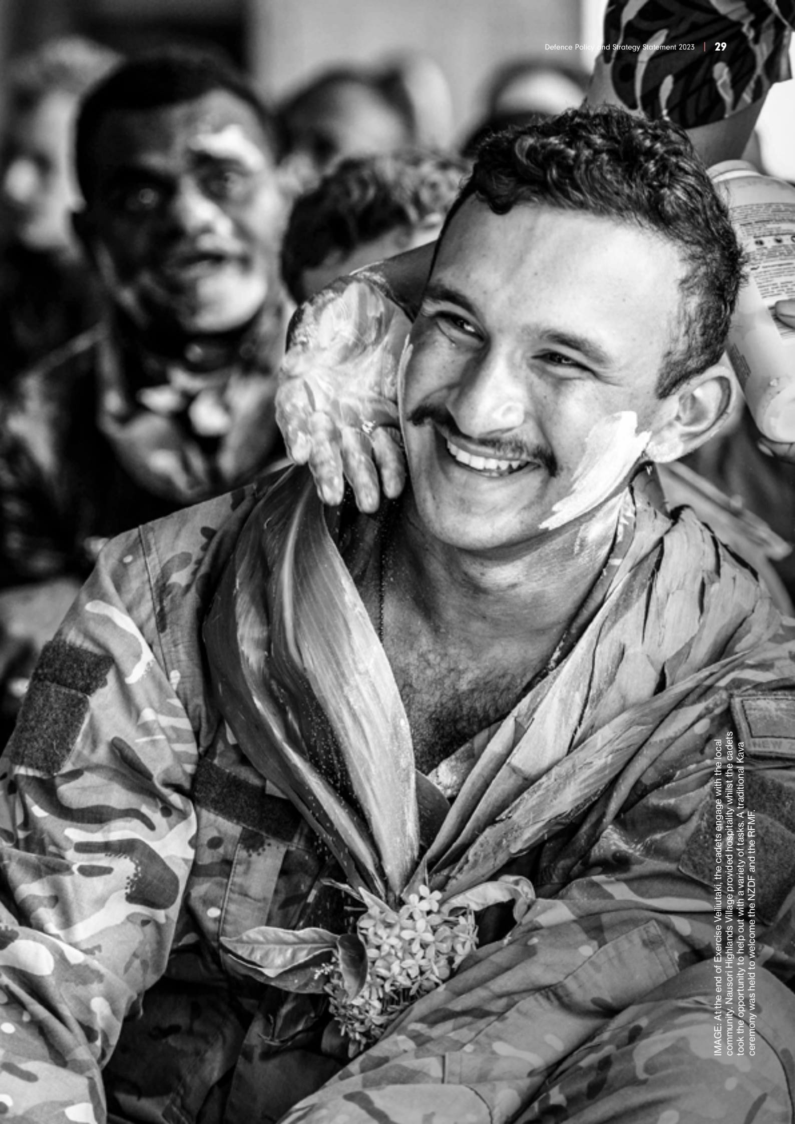
IMAGE: At the end of Exercise Veitiutaki, the cadets engage with the local community. Nausori Highlands Village provided hospitality whilst the cadets took the opportunity to help out with a variety of tasks. A traditional Kava ceremony was held to welcome the NZDF and the RFMF.