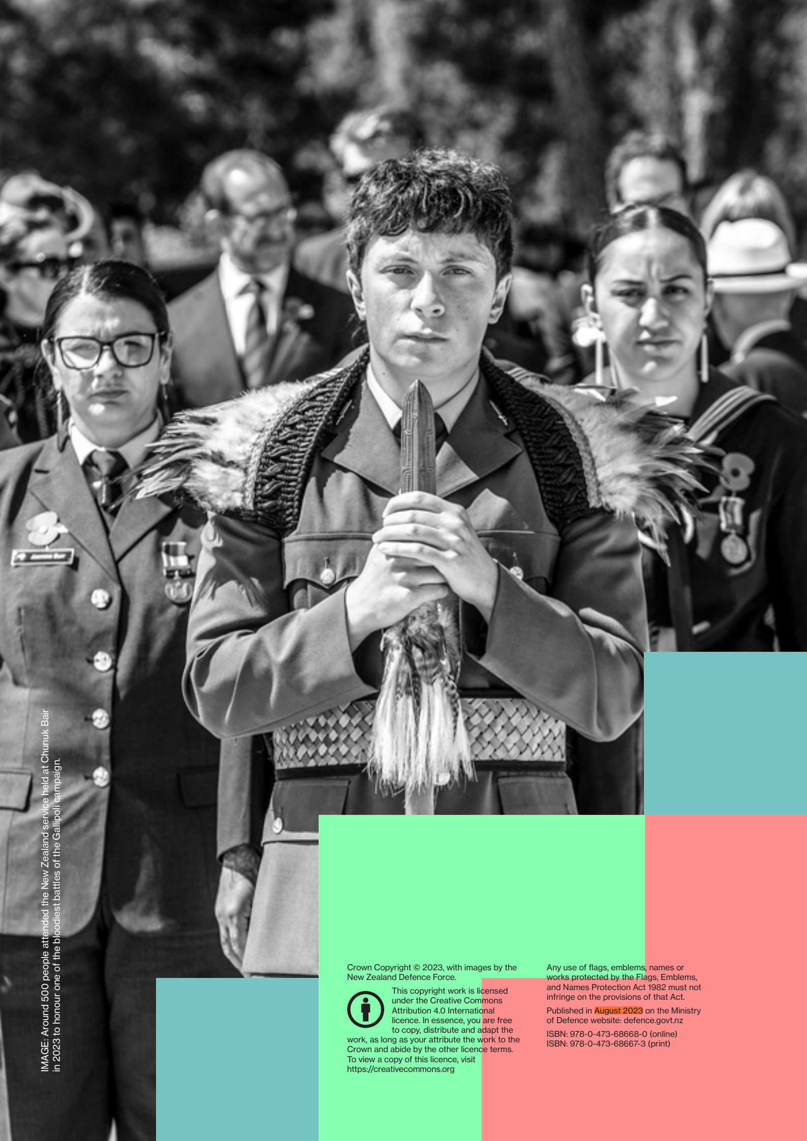
IMAGE: Around 5000 people attended the New Zealand service held at Churuk Bair in 2023 to honour one of the bloodiest battles of the Gallipoli campaign.