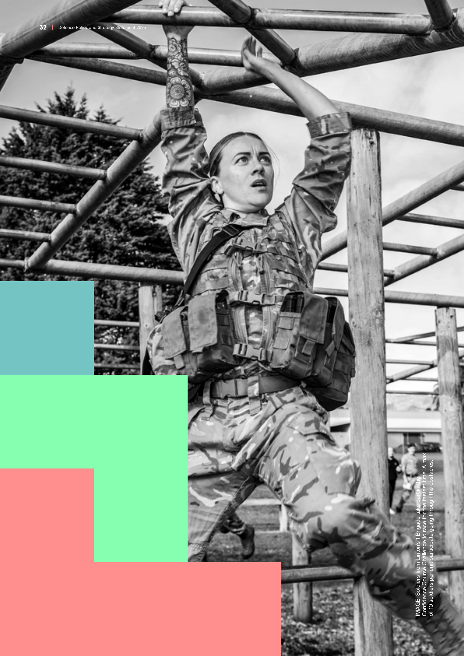
IMAGE: Soldiers from Linton's 1 Brigade take part in the Confidence Course Challenge to race for the fastest time. A max of 10 soldiers per unit participate going through the obstacles.