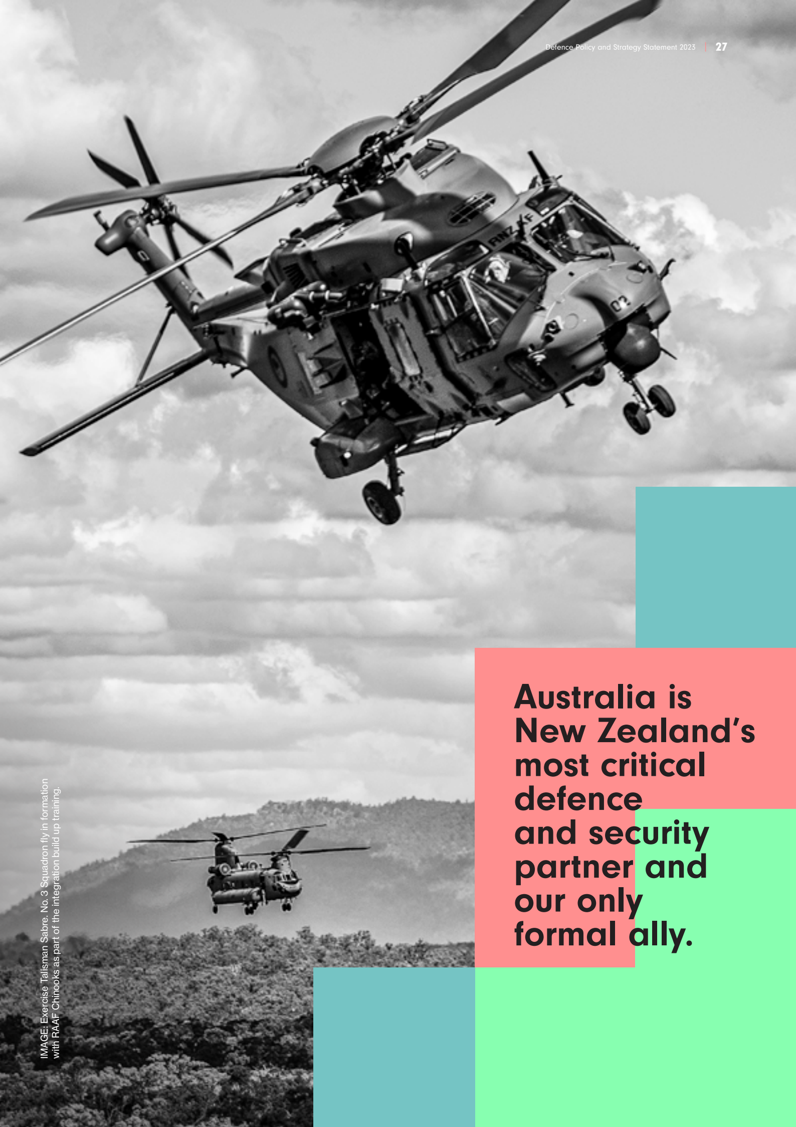
IMAGE: Exercise Talisman Sabre. No. 3 Squadron fly in formation with RAAF Chinooks as part of the integration build up training.

Australia is New Zealand's most critical defence and security partner and our only formal ally.