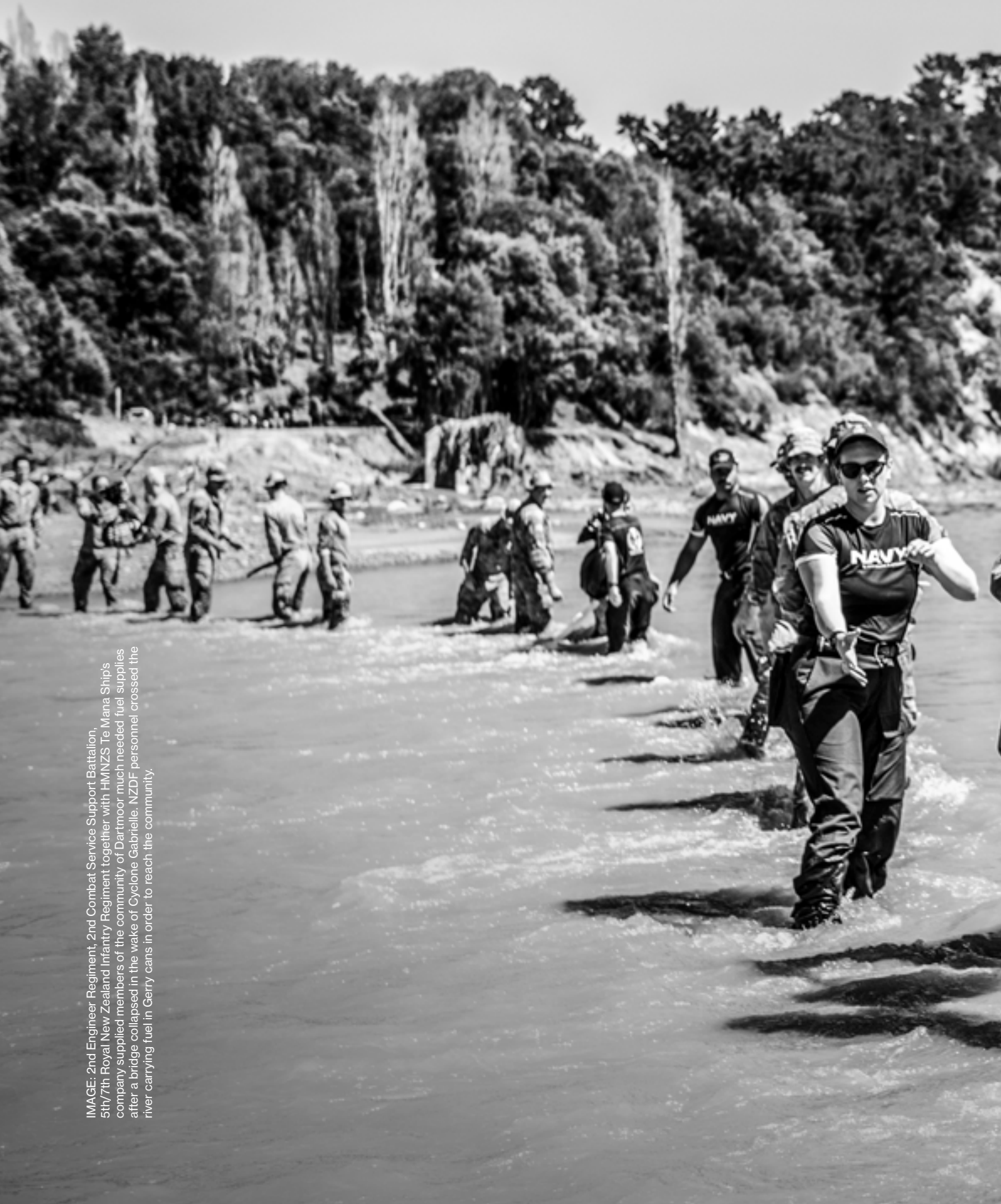
IMAGE: 2nd Engineer Regiment, 2nd Combat Service Support Battalion, 5th/7th Royal New Zealand Infantry Regiment together with HMNZS Te Mana Ship's company supplied members of the community of Dartmoor, much needed fuel supplies after a bridge collapsed in the wake of Cyclone Gabrielle. NZDF personnel crossed the river carrying fuel in Gerry cans in order to reach the community.